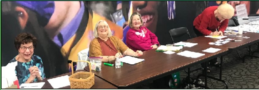
↑ Helpful officers at the check-in table.