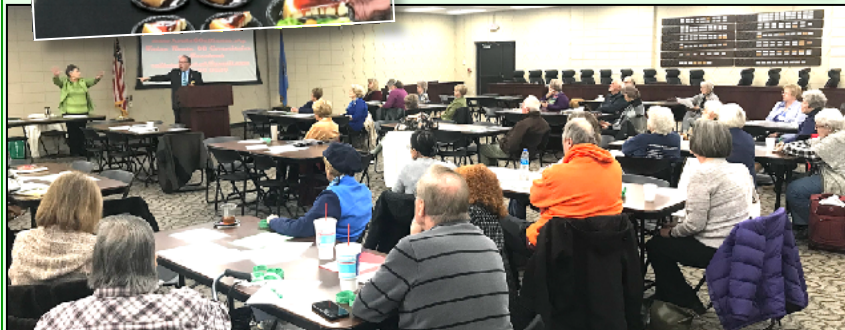
↑ Above is a portion of the 43 members who attended the November meeting.