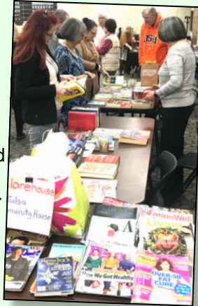
Shoppers at the book and magazine table. →