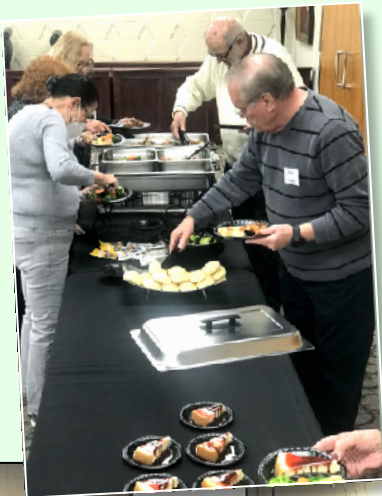
← Lunch with friends.