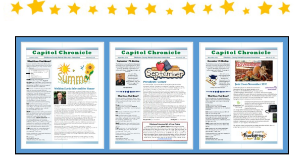
Did you miss an issue of the Capitol Chronicle? Go to

Tuesday, October 3 RENASSANCE HOTEL 6808 S. 107 E AVENUE Tulsa, OK