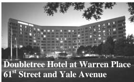
Doubletree Hotel at Warren Place 61 st Street and Yale Avenue

OREA's main event of the year will be held at the Doubletree Hotel in Tulsa on Friday, May 20th. The hotel is directly west across the street from St. Francis Hospital.